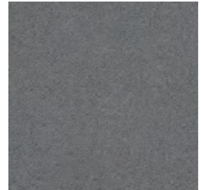
▾ 2G684 Matt Finish 600×600×20mm 24"×24"