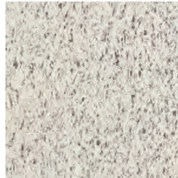
▾ 2G688 600×600×20mm 24"×24"