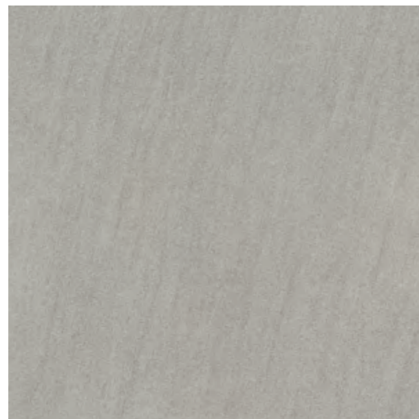
▾ 2K6NS103WC Anti-Slipping Finish 600×600×20mm 24"×24"