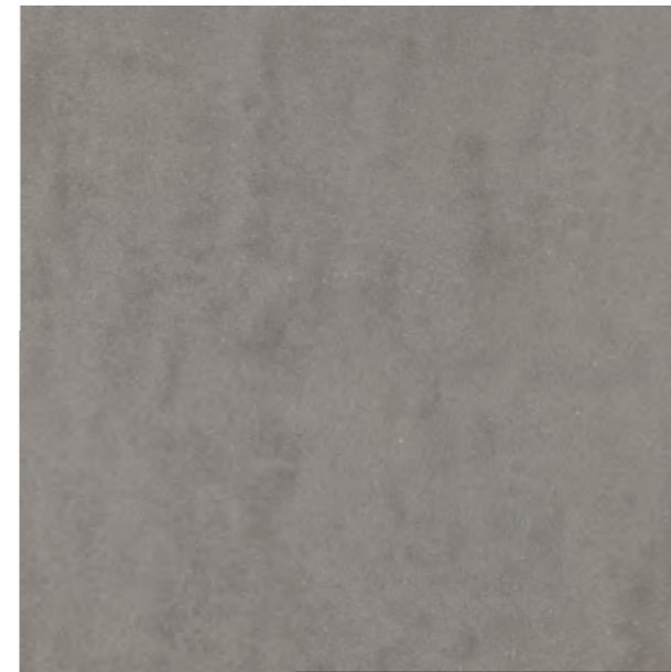
▼ 2HTS6605C Anti-Slipping Finish ✓ 600×600×20mm 24"×24"