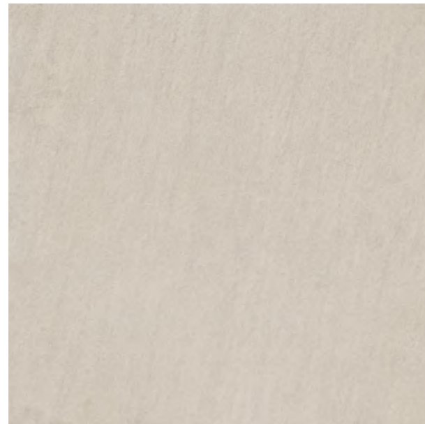
▾ 2K6NS101WC Anti-Slipping Finish 600×600×20mm 24"×24"