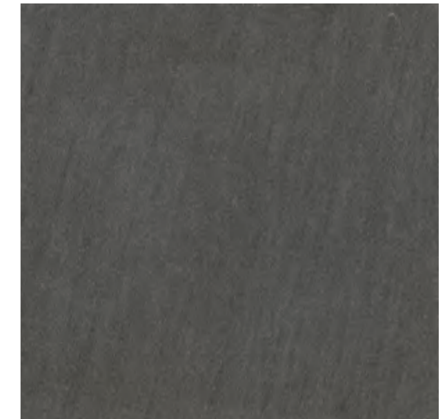
▾ 2K6NS107WC Anti-Slipping Finish 600×600×20mm 24"×24"