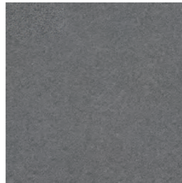
▾ 2G684C Anti-Slipping Finish 600×600×20mm 24"×24"