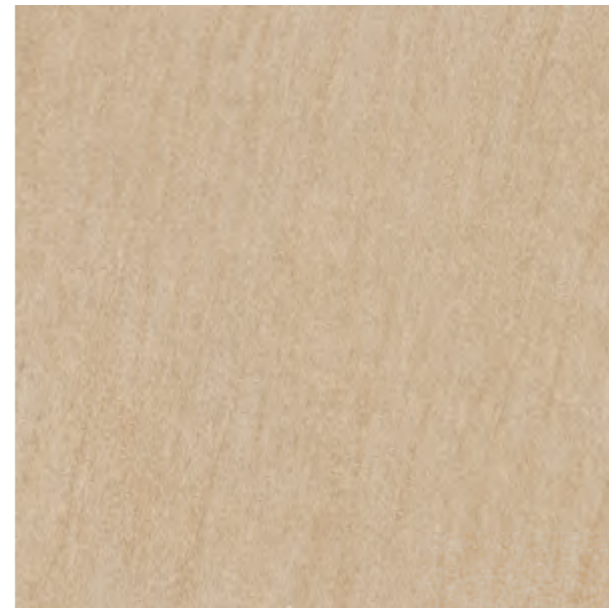
▾ 2K6NS102WC Anti-Slipping Finish 600×600×20mm 24"×24"