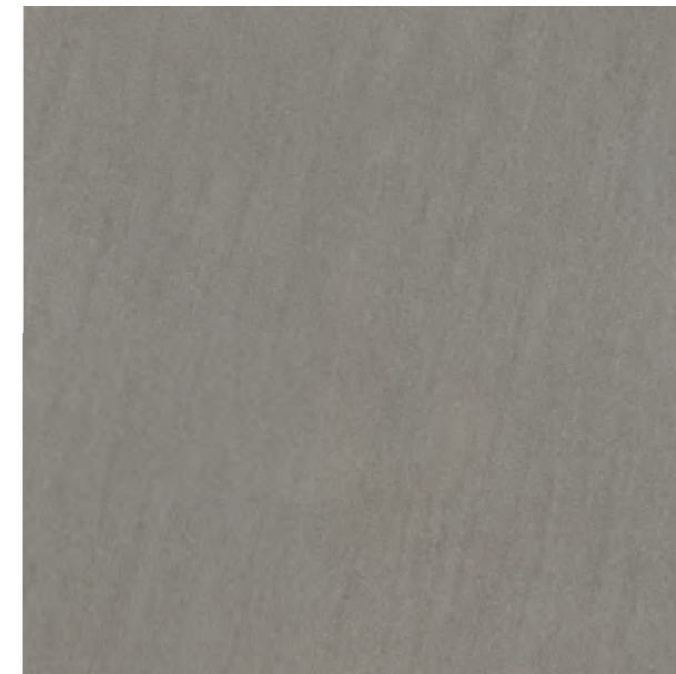
▾ 2K6NS105WC Anti-Slipping Finish 600×600×20mm 24"×24"