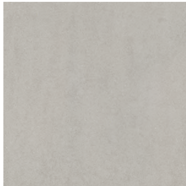
▼ 2HTS6603C Anti-Slipping Finish ✓ 600×600×20mm 24"×24"