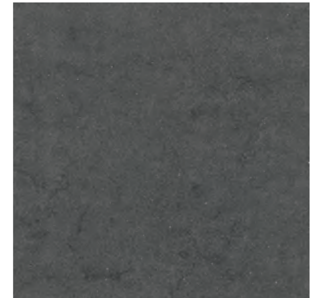
▼ 2HTS6607C Anti-Slipping Finish ✓ 600×600×20mm 24"×24"