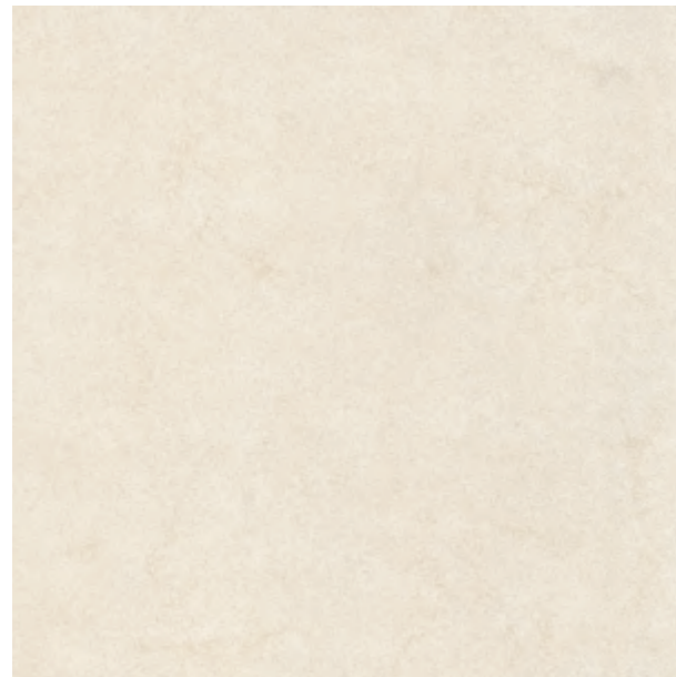
▼ 2HTS6601C Anti-Slipping Finish ✓ 600×600×20mm 24"×24"