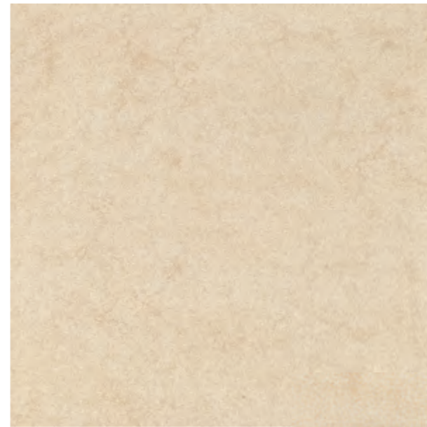
▼ 2HTS6602C Anti-Slipping Finish ✓ 600×600×20mm 24"×24"